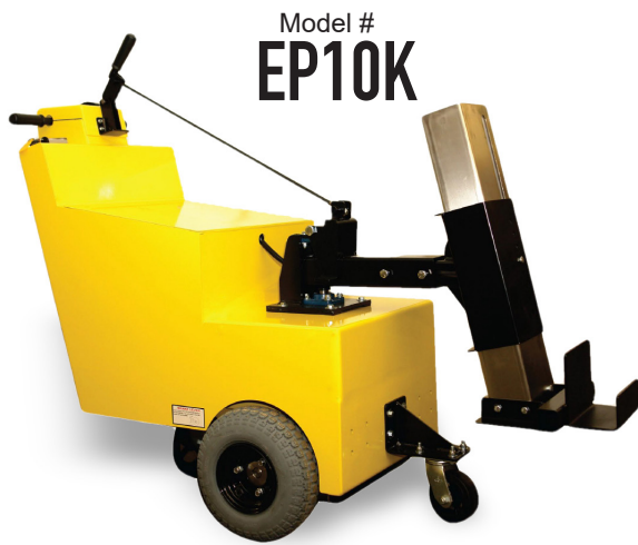
Model # EP10K

Design for heavier loads using a “U” channel to grab the end rail of the cart.