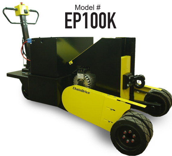
Model # EP100K

48-volt electric chain drive pusher. Designed for the most demanding pushing or pulling jobs.